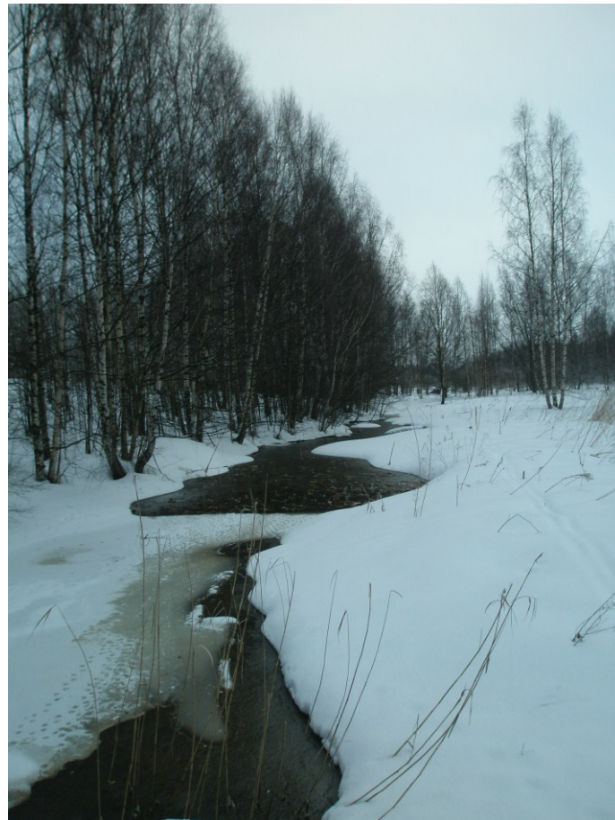
Figure 4. Ditch surrounding the dog park area.

On the Figure 4 is the ditch surrounding the dog park area.