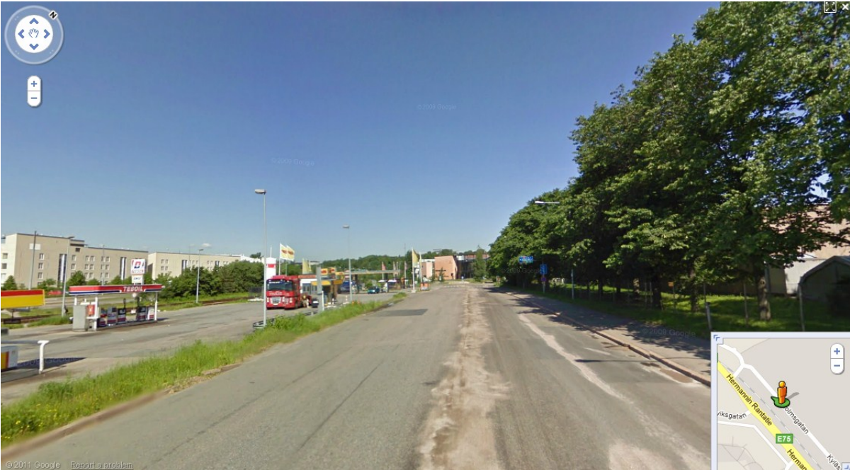
Figure 1. Arcada 2 before construction.

On Figure 2 it can be seen that some of the road has been "pached" with asphalt and the last part of the road has been blocked for entrance.