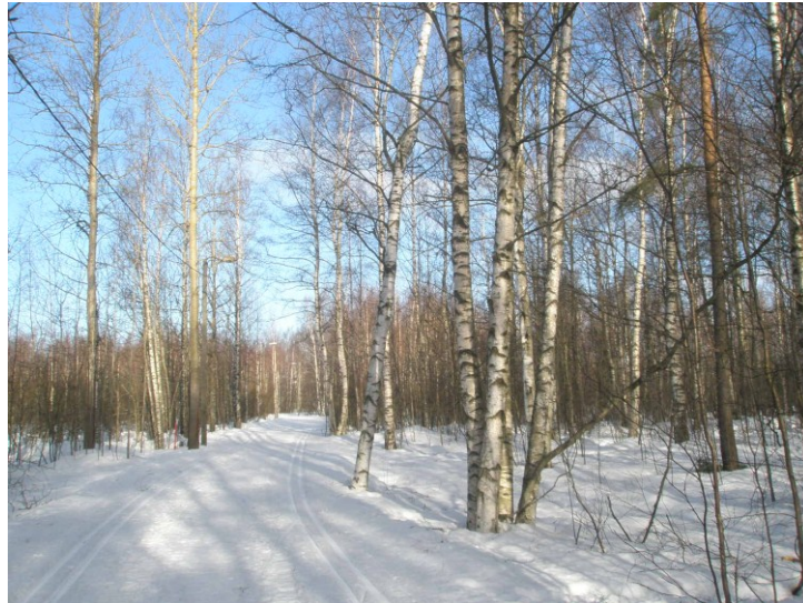
Figure 3. Outdoor route surrounding the dog park area.

On the Figure 4 is the ditch surrounding the dog park area.