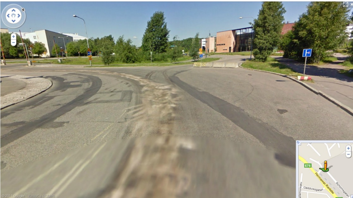
Figure 2. The last part of the road blocked for entrance and the road has been pached with asphalt.

On Figure 2 it can be seen that some of the road has been "pached" with asphalt and the last part of the road has been blocked for entrance.